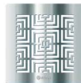
Lux - 4