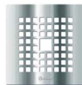
Lux - 1