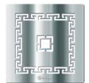
Lux - 3