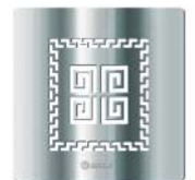
Lux - 6